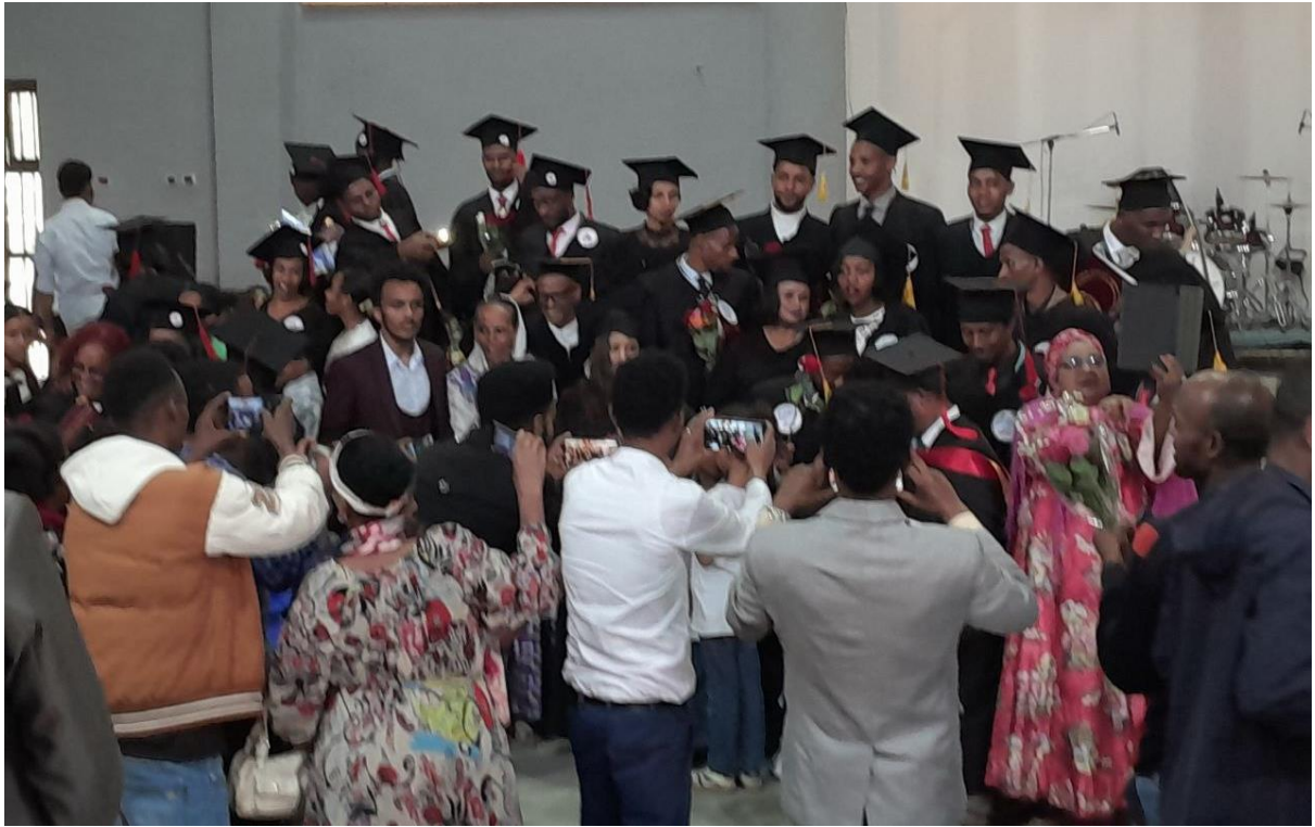
Bole Hub School 3 rd batch graduates