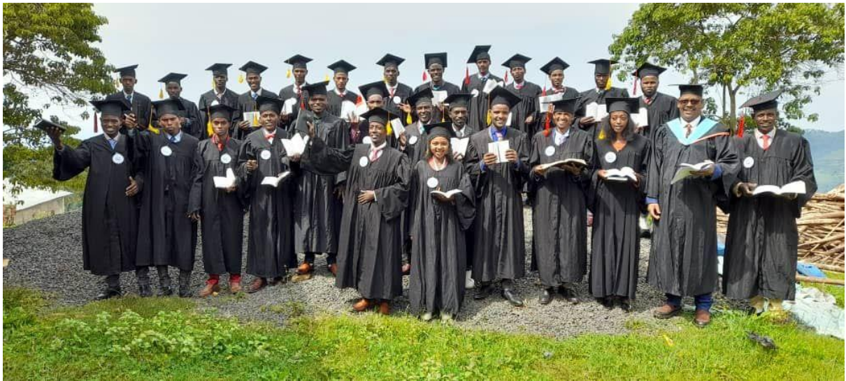
Konta Hub School 2 nd Batch Graduates