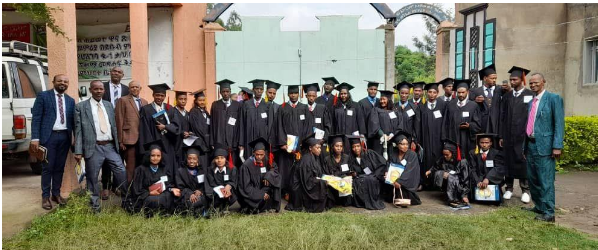
Hallaba Hub School 4 th Batch Graduates