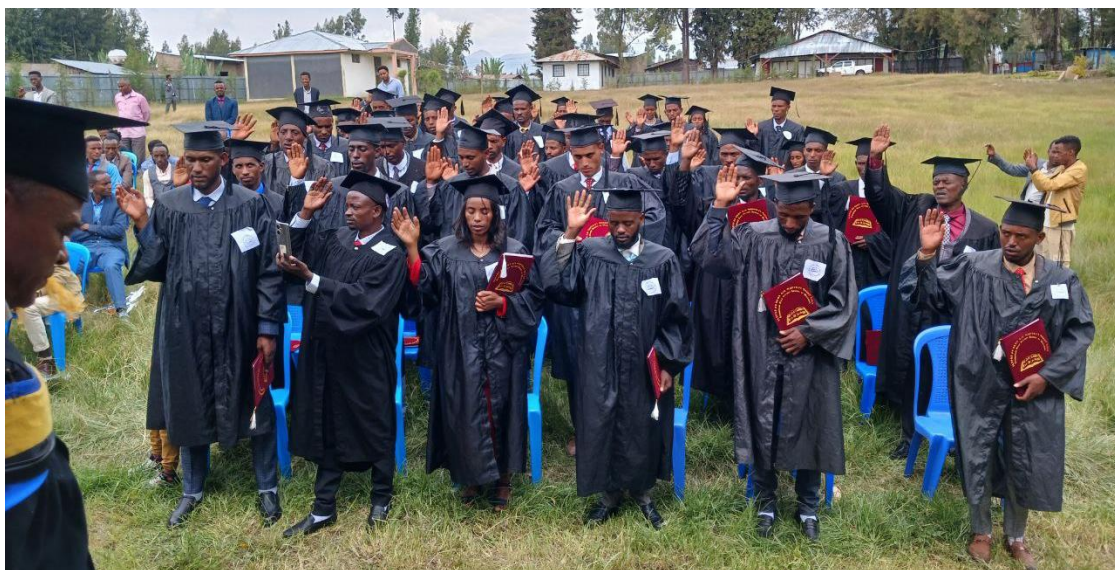
Goba Hub School 8 th Batch Graduates