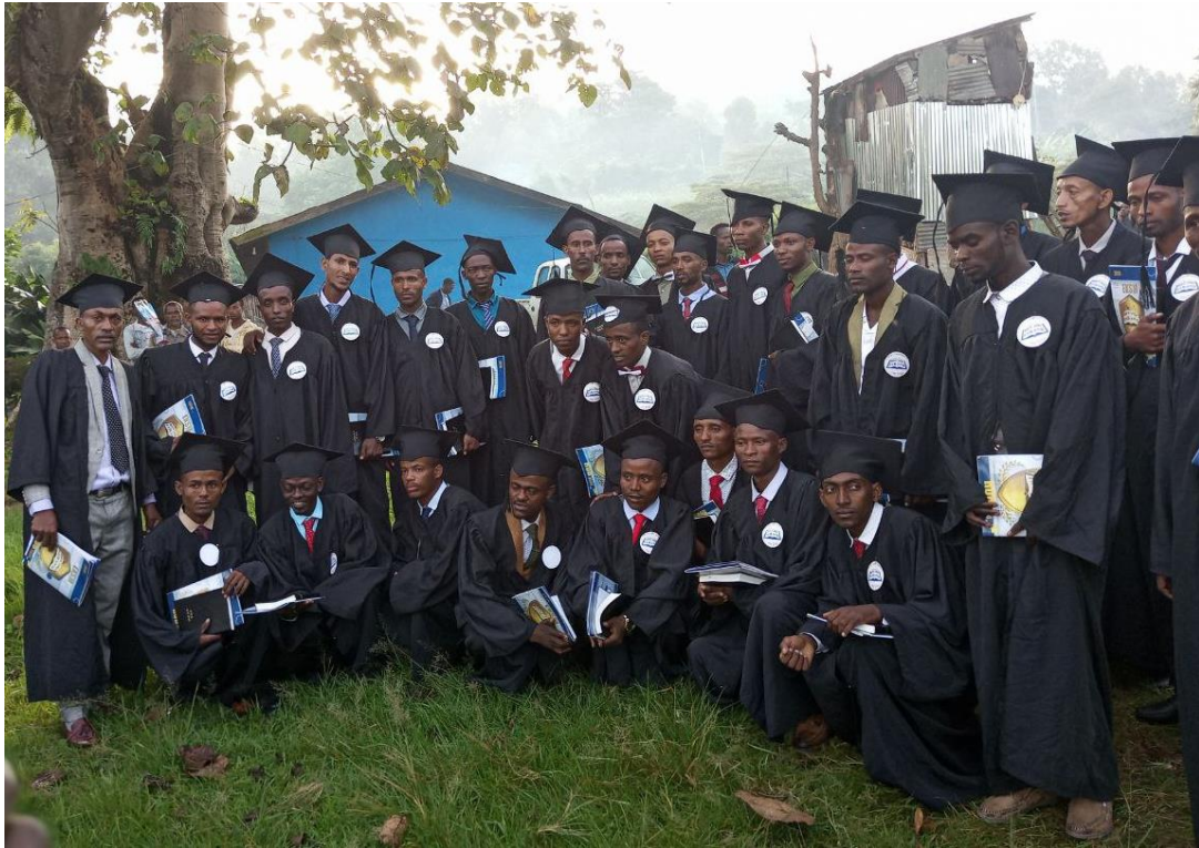
Bonga Hub School 6 th Batch Graduates