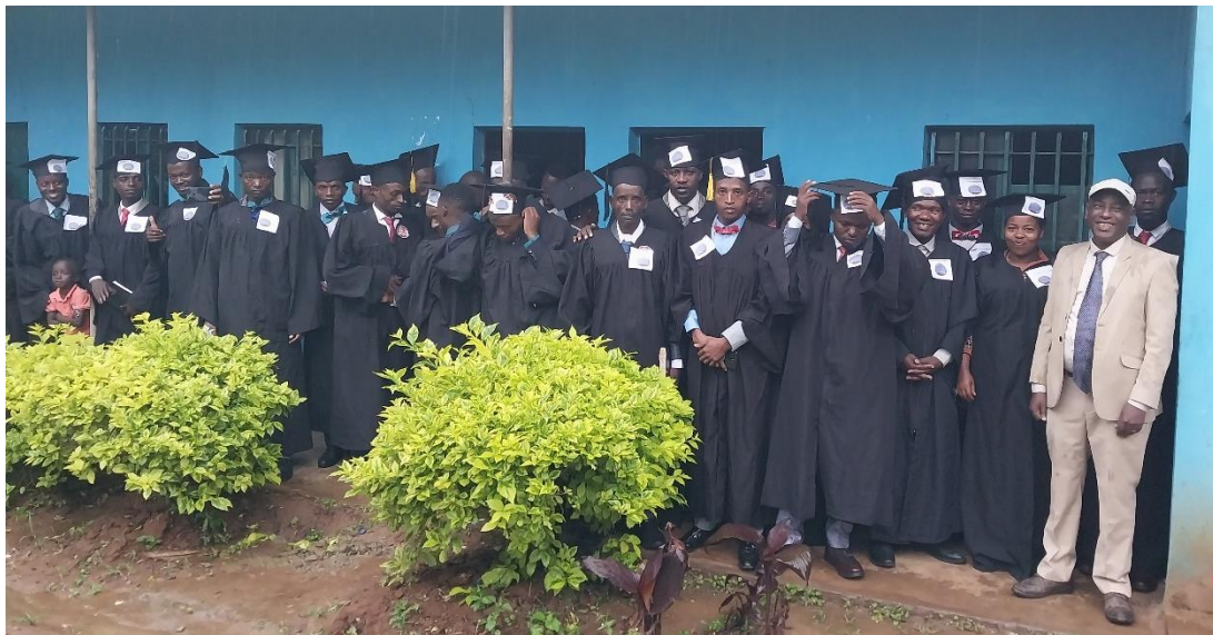
Jinka Hub School 3 rd Batch Graduates