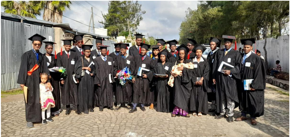
Wolkite Hub School 4 th batch Graduates