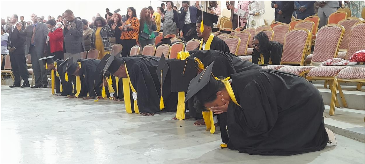
Bole Hub School 2 nd batch graduates