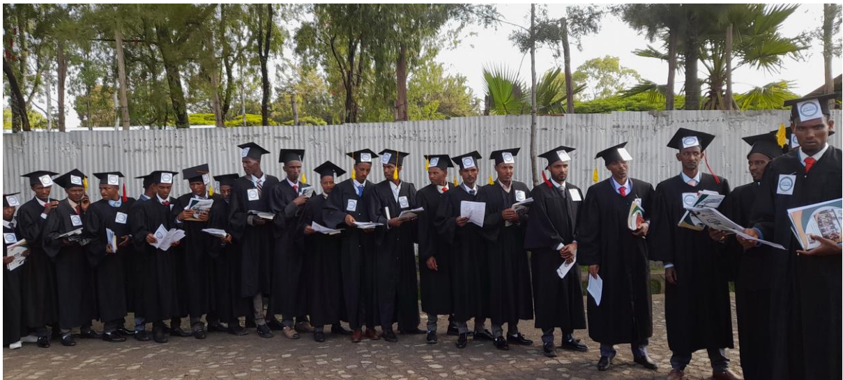
Wolkite Hub School 3 rd batch Graduates