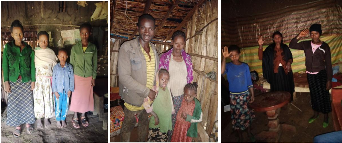
This three families are released from demons and has believed in Jesus