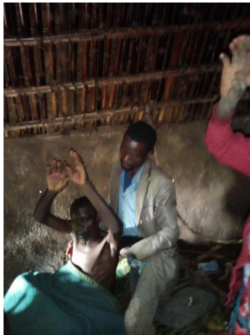
After the two witches has believed in Jesus their families also surrender their lives to worship Him