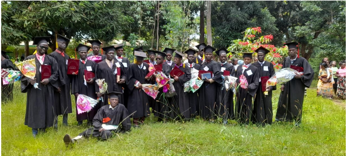
Jinka HubSchool 2 nd Batch Graduates