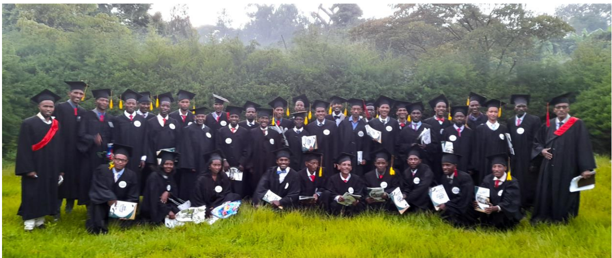
Bonga HubSchool 5 th Batch Graduates with Trainers