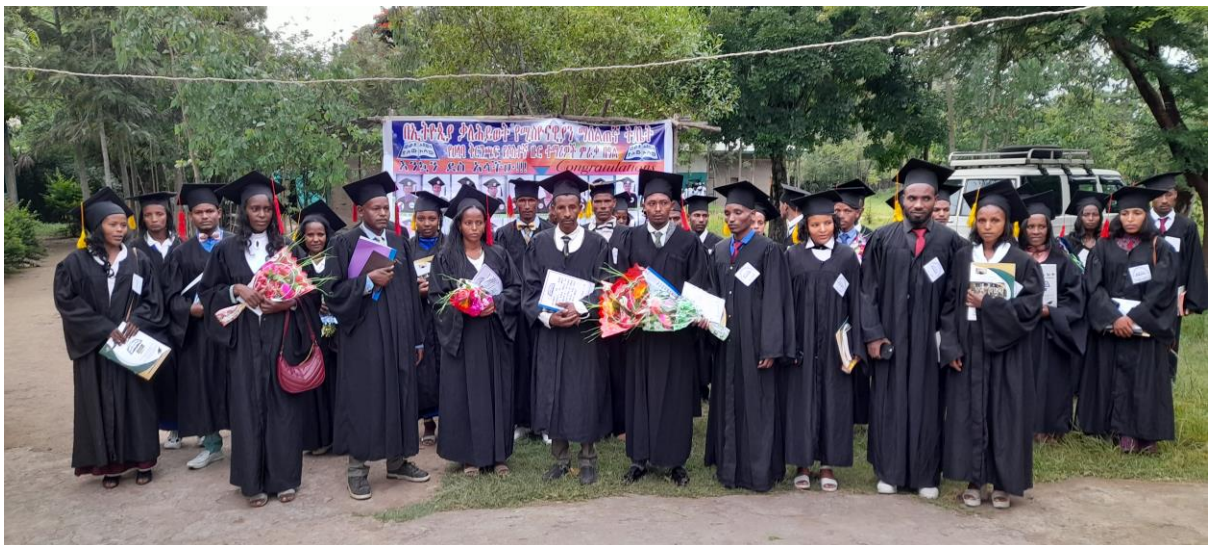
Hallaba HubSchool 3 rd Batch Graduates