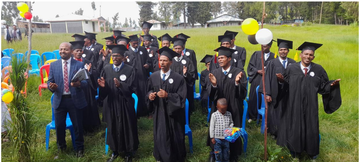
Goba HubSchool 7 th Batch Graduates