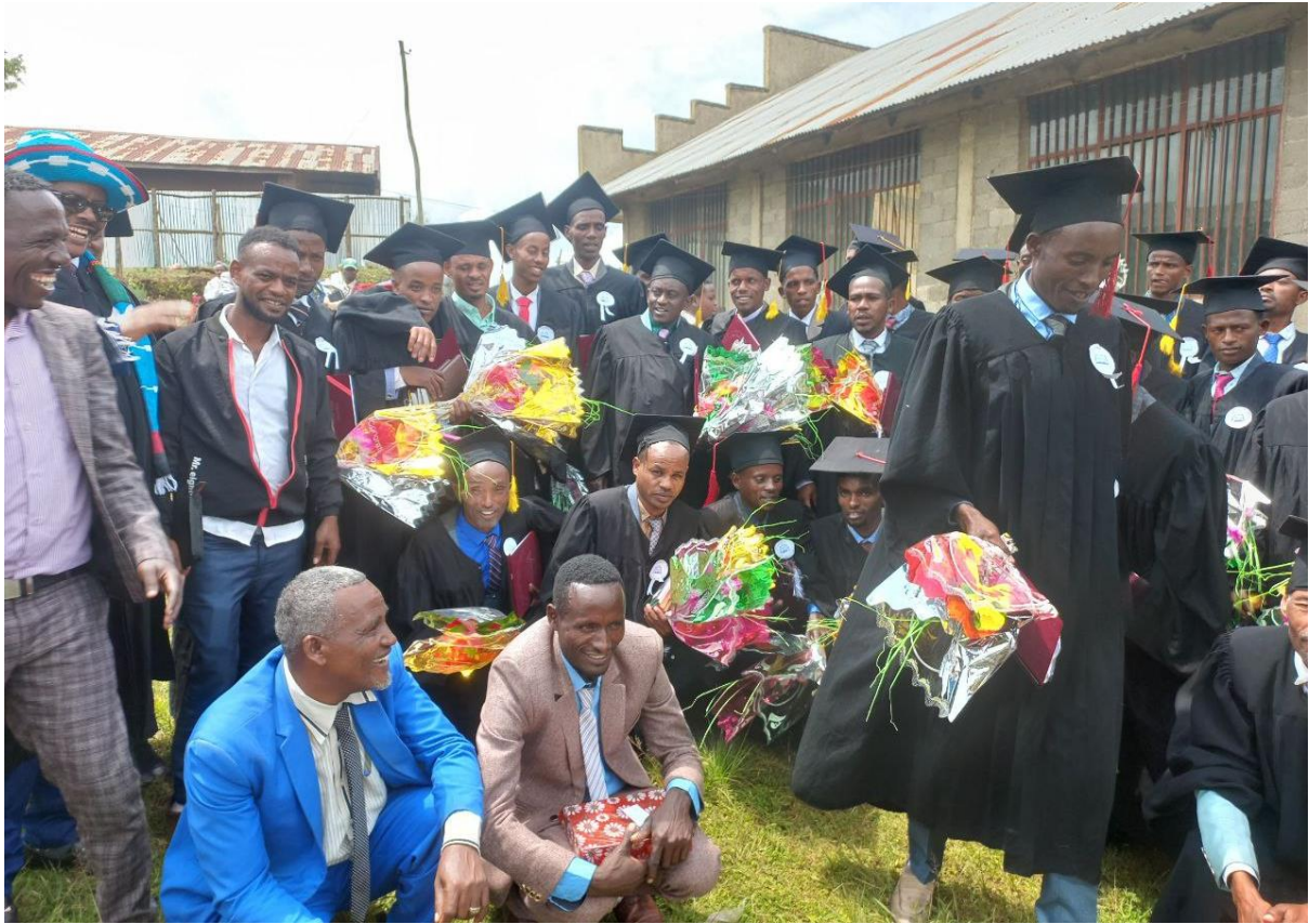
Konta Hub School 1 st Round Graduates